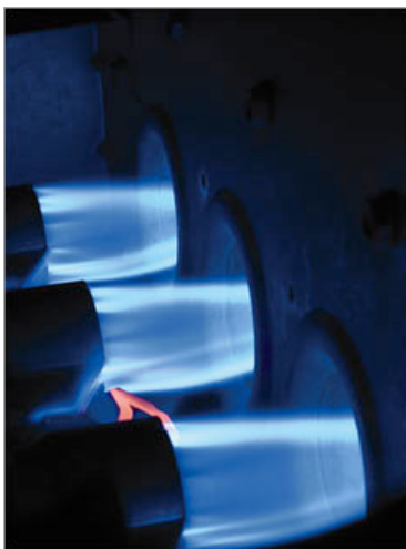
Natural gas burns cleaner than oil, but stick with an oil system if you've already got one.

Quick Fix : Air Filters (costing about $30 a year) could save you about $100 a year if you change them every three months, according to the U.S. Green Building Council. Chose a pleated model - it'll do a better job.